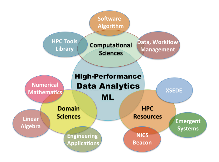
Figure 1: Design of the RECSEM Computational Science program.

and staff in making this program a fruitful experience for the participants, we discuss the experiences and resolutions in managing and coordinating the program, directing mentorship of individual projects, and lessons learned via exemplary data science projects building on native linear algebra from ICL.